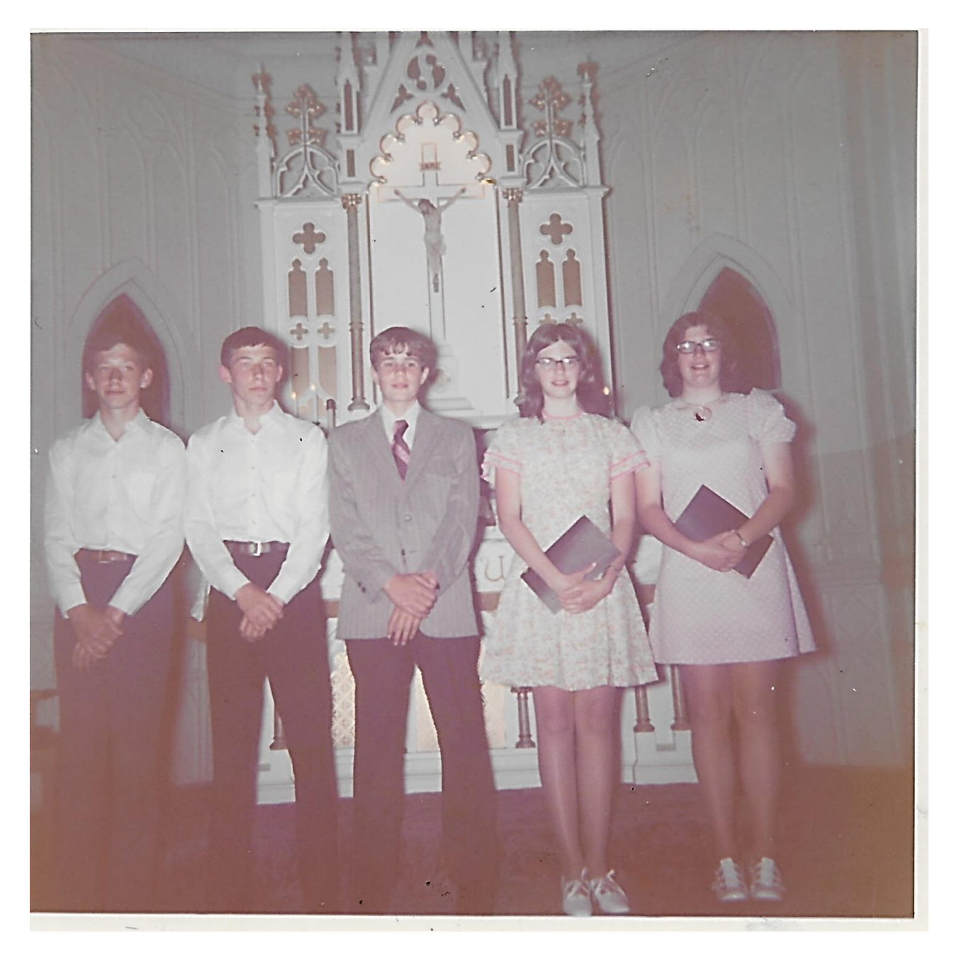
First 8<sup>th</sup> Grade Graduating Class from St. John's School